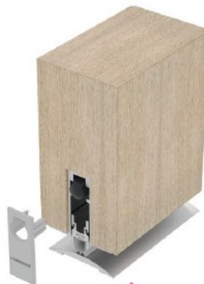
LAS8005 si (shown with LAS4002)