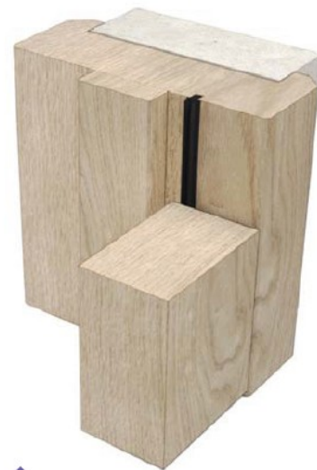
▲ LAS1011 Firtree™